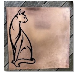
Step 3 - Substrate

I wanted to incorporate as many of our products as possible. Elytra (feathers!!) abalone, peacock ore, handmade glass.