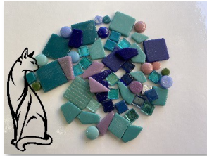
Step 1 - Colour Palette

I will build up Percy's body using Pal Tiya to give him some dimension.