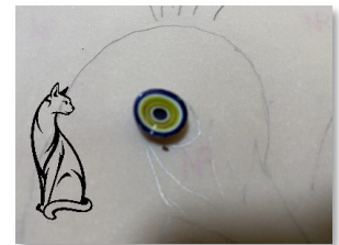
Step 6 - The Eye

I overlaid various pieces on parts of the drawing. Handmade glass for the body, elytra for the tail base, abalone cabochons for the tail feather eyes. Tusk shells and peacock ore for his crest or comb.