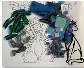
Step 2 - Concept Planning

The colours in Merlin Mix #4 made me think of a peacock. All those lovely turquoise and teals, with a hint of purple.