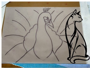
Step 4 - Rough-out Drawing

Percy needed something a bit special. I had this piece of circuit board backing hanging about, and thought the copper a perfect foil for the peacock colours.